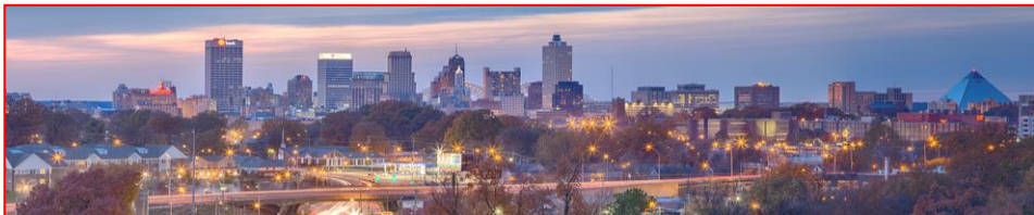
Memphis, TN – site of our 2018 Reunion – 30 May to 2 June. Complete details in our Dec Newsletter.