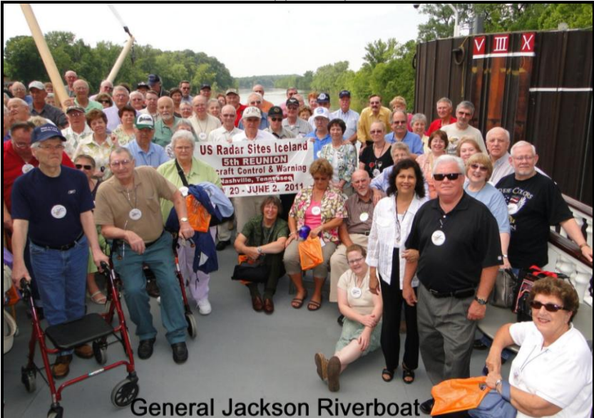
Above photo shows less than half of those who attended the reunion.