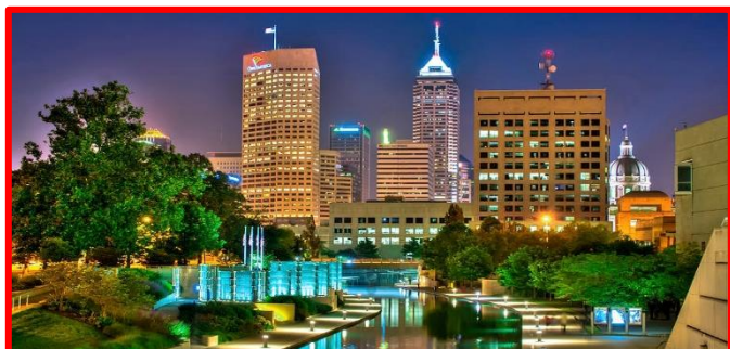
Downtown Indianapolis - as viewed from the West

Tuesday to Friday, 6 to 9 September 2022